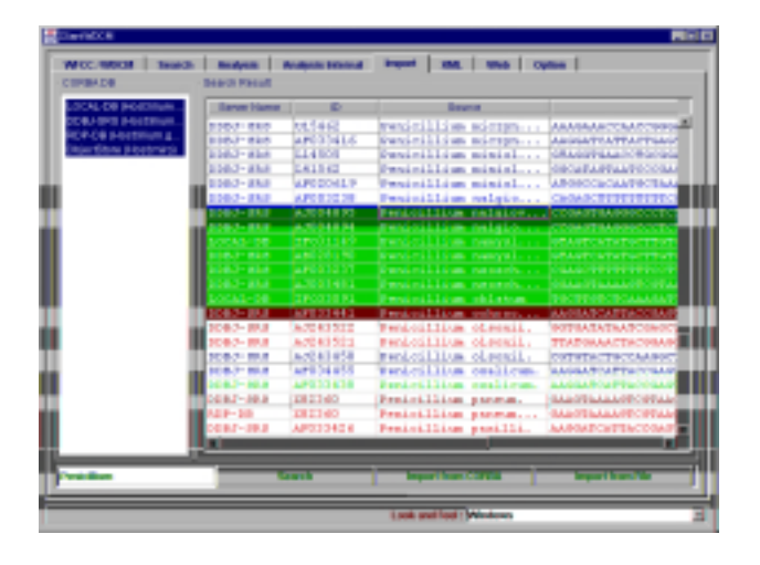
Figure 1: An example of storing data from 4 different databases

We evaluated XML technology while we developed the current version of the workbench. Based on the evaluation, we will convert the database engine to XML files in order to improve the portability of the system especially for the biological resources centers that often lack powerful information environment and informatics experts.